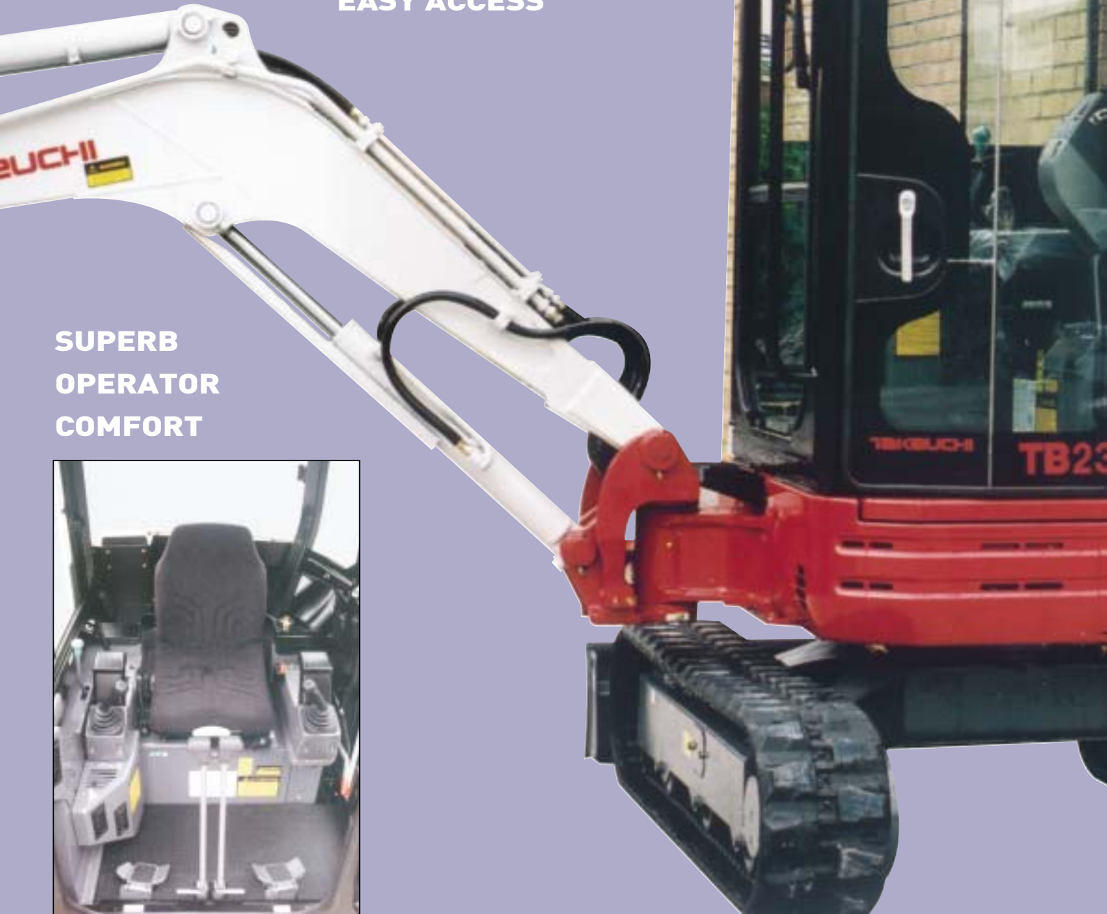
SUPERB OPERATOR COMFORT