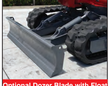
Optional Dozer Blade with Float