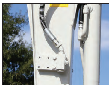
Auxiliary Hydraulic Lines