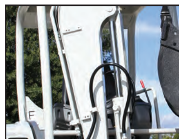
Main Boom Cylinder Guard