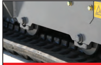
Triple Flanged Track Rollers