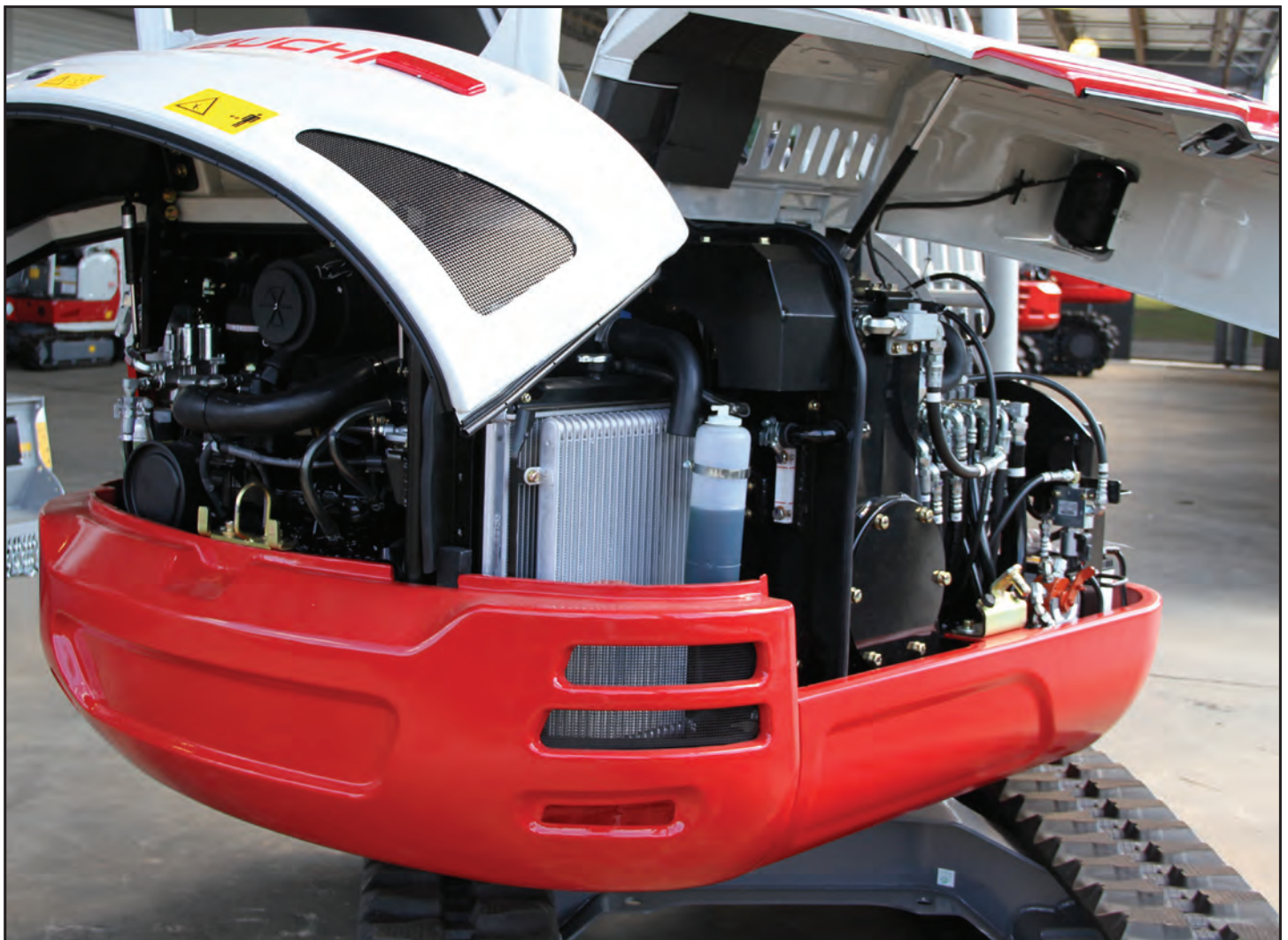
Large lockable service hoods provide vandalism protection and outstanding maintenance access.

The operator is protected by a ROPS / TOPS / OPG (TOP Guard, Level I) cab and canopy that keeps the operator safe and comfortable on any job site.