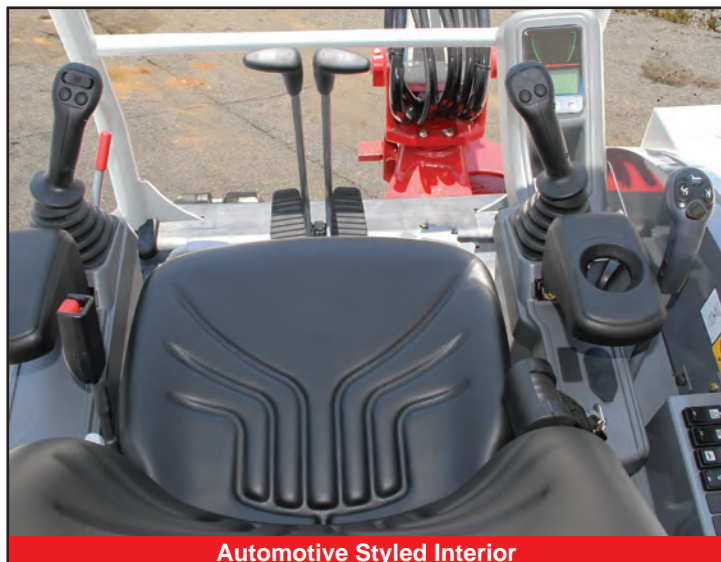
Automotive Styled Interior

*Functions may not be available in all countries, so please consult your Takeuchi dealer for details.