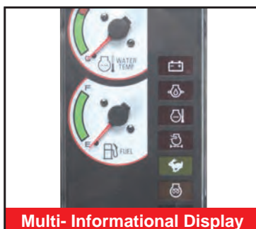
Multi- Informational Display