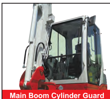
Main Boom Cylinder Guard