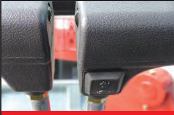
2-Speed Travel w/ Auto Shift