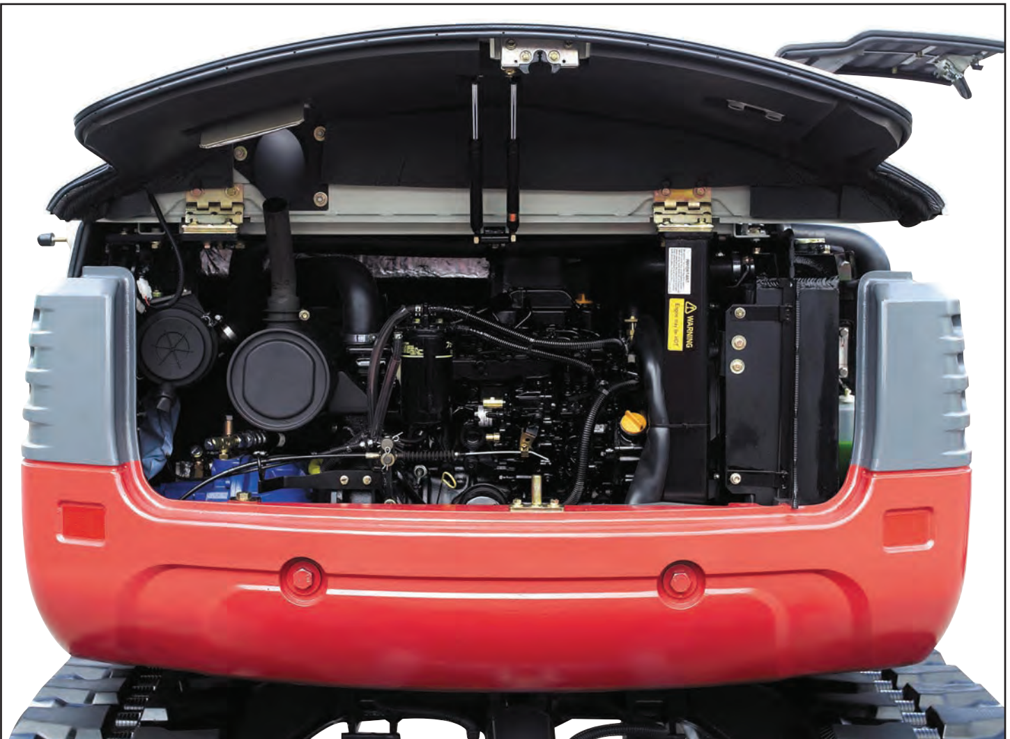
Large lockable service hoods provide vandalism protection and outstanding maintenance access.

The interior provides excellent operator comfort with pilot operated controls, travel controls with large foot pedals, easy to reach rocker switches and a throttle lever control.