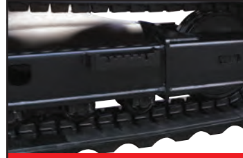
Triple Flanged Track Rollers