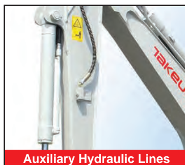
Auxiliary Hydraulic Lines