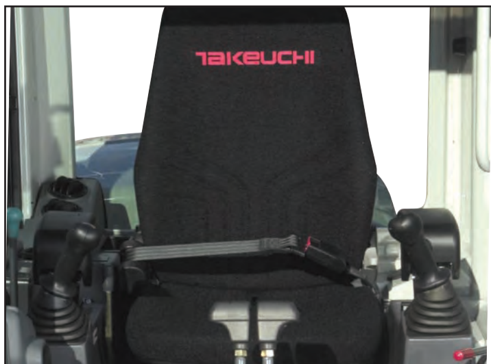
Automotive Styled Interior