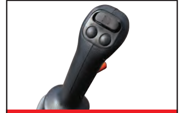
Hydraulic Pilot Controls

Delivering outstanding performance and versatility, the TB250 is one of Takeuchi's most popular conventional tail swing excavators.