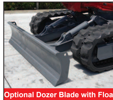
Optional Dozer Blade with Float