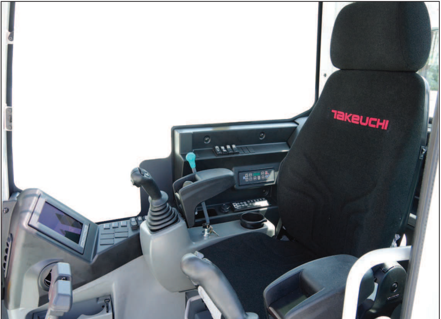
Spacious Operator's Station with Easy to Reach Controls and Switches

Additional features include up to four auxiliary hydraulic circuits for greater attachment versatility, boom and arm holding valves for added protection, and a large wrap around counterweight for stability.