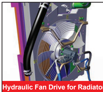
Hydraulic Fan Drive for Radiator