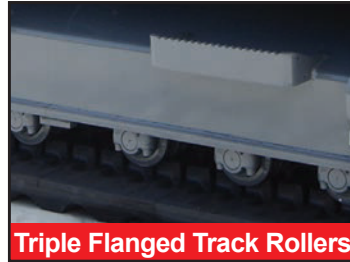
Triple Flanged Track Rollers