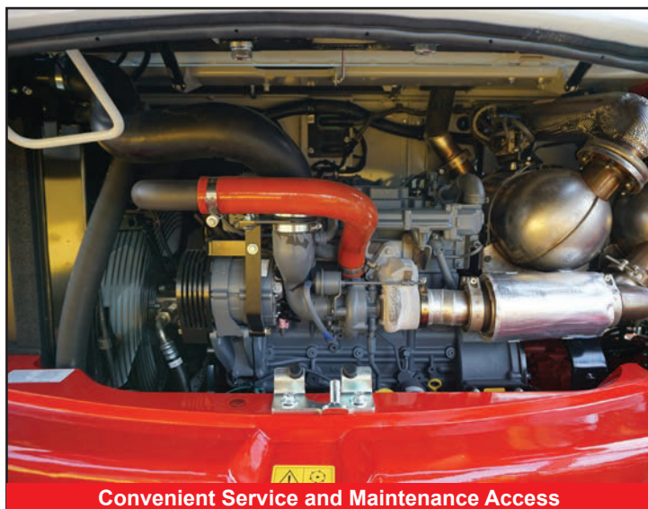
Convenient Service and Maintenance Access

*Functions may not be available in all countries, so please consult your Takeuchi dealer for details.