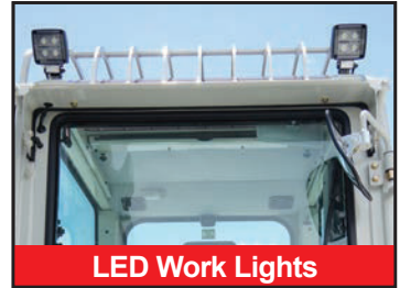
LED Work Lights

The new TB2150 hydraulic excavator delivers greater functionality, performance, comfort, and serviceability.