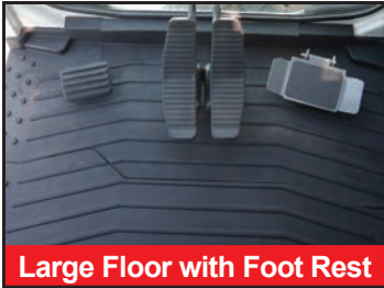
Large Floor with Foot Rest