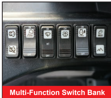
Multi-Function Switch Bank