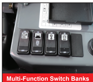
Multi-Function Switch Banks