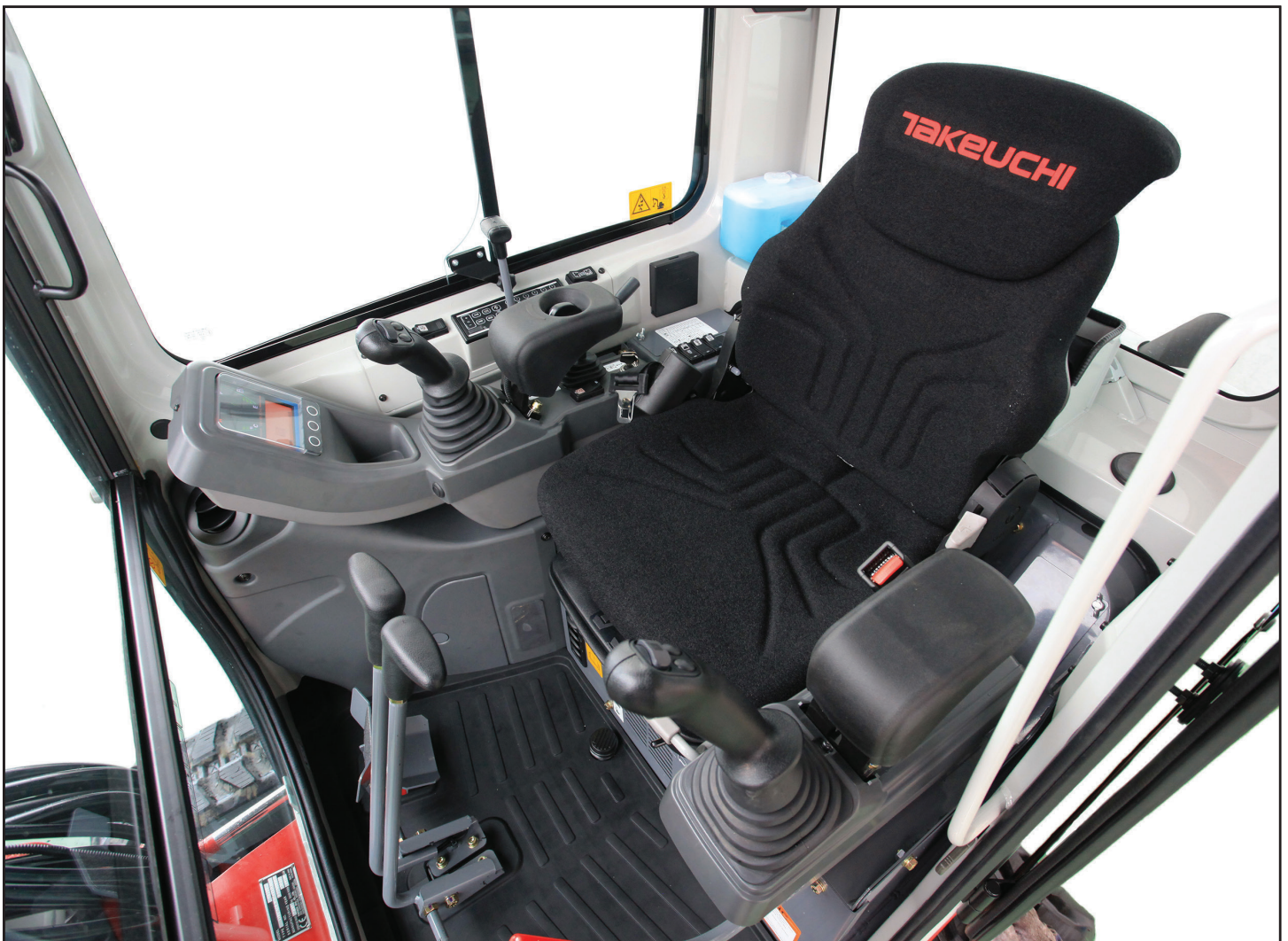
Spacious Operator's Station with Easy to Reach Controls and Switches.

The operator is protected by a ROPS / TOPS / OPG (TOP Guard, Level I) cab and canopy that keeps the operator safe and comfortable on any job site.