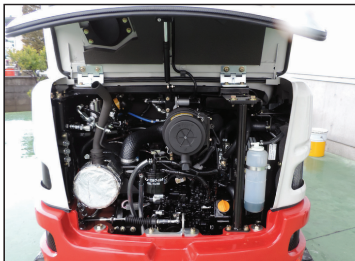
Large Lockable Service Covers Provide Ground Level Access