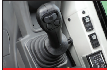
Pilot Operated Controls