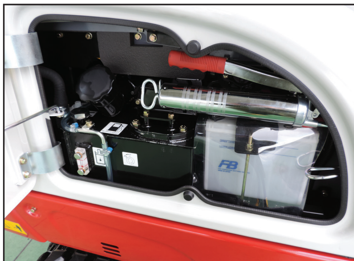
Convenient Service and Maintenance Access

*Functions may not be available in all countries, so please consult your Takeuchi dealer for details.