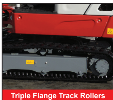
Triple Flange Track Rollers