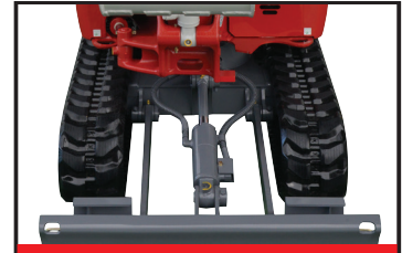
Retractable Track Frame

The TB225 features all steel construction, a spacious operator station, smooth hydraulic pilot joystick controls that deliver precise responsive controls. The TB225 provides the operator with the best in class engine output that allows more power and increases productivity.