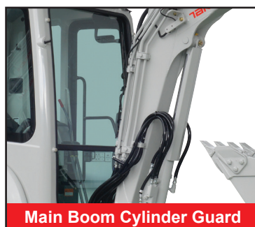
Main Boom Cylinder Guard