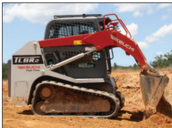
Greater Bucket and Lift Arm Forces

*Functions may not be available in all countries, so please consult your Takeuchi dealer for details.