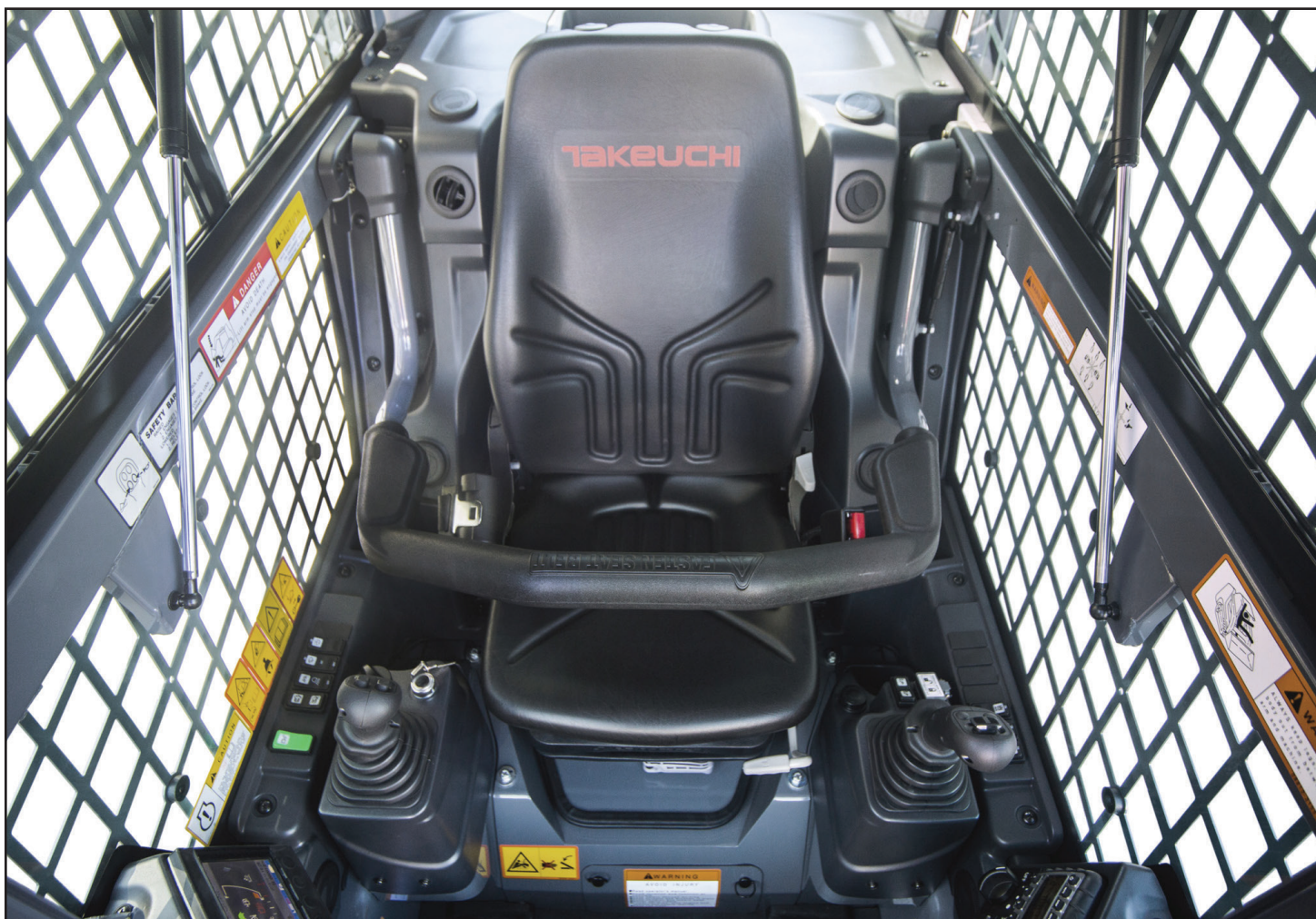
Spacious operator's platform with easy to reach controls and switches.

Creep mode is an optional feature on the TL8R-2. This feature will enable operators to precisely match the forward speed of the track loader to a particular attachment without having to constantly meter the travel lever. Creep mode is ideal for attachments that require a consistent, repeatable travel speed, such as a cold planner and trencher.