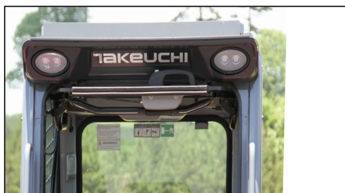
LED Work Lights