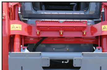
Lower Cross Member & Step