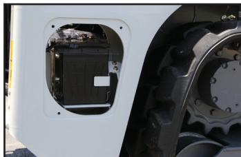
Battery Access Panel