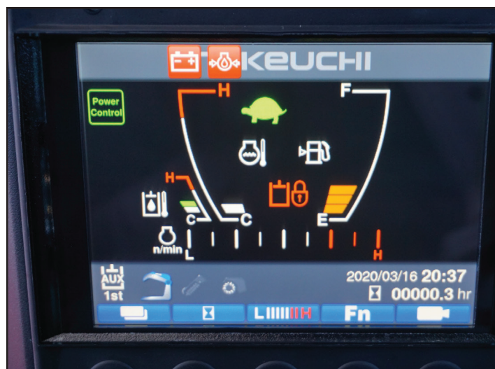
Convenient Service and Maintenance Access