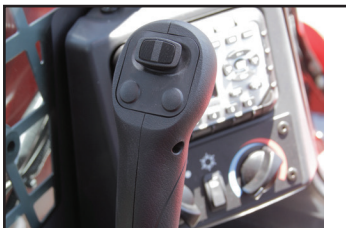
Pilot Operated Controls