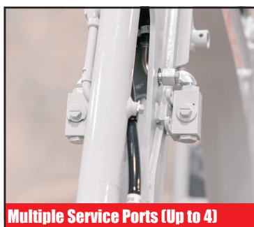
Multiple Service Ports (Up to 4)