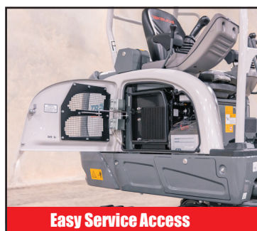
Easy Service Access