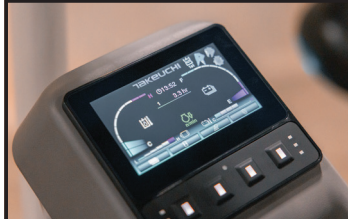
4.3" Color Display