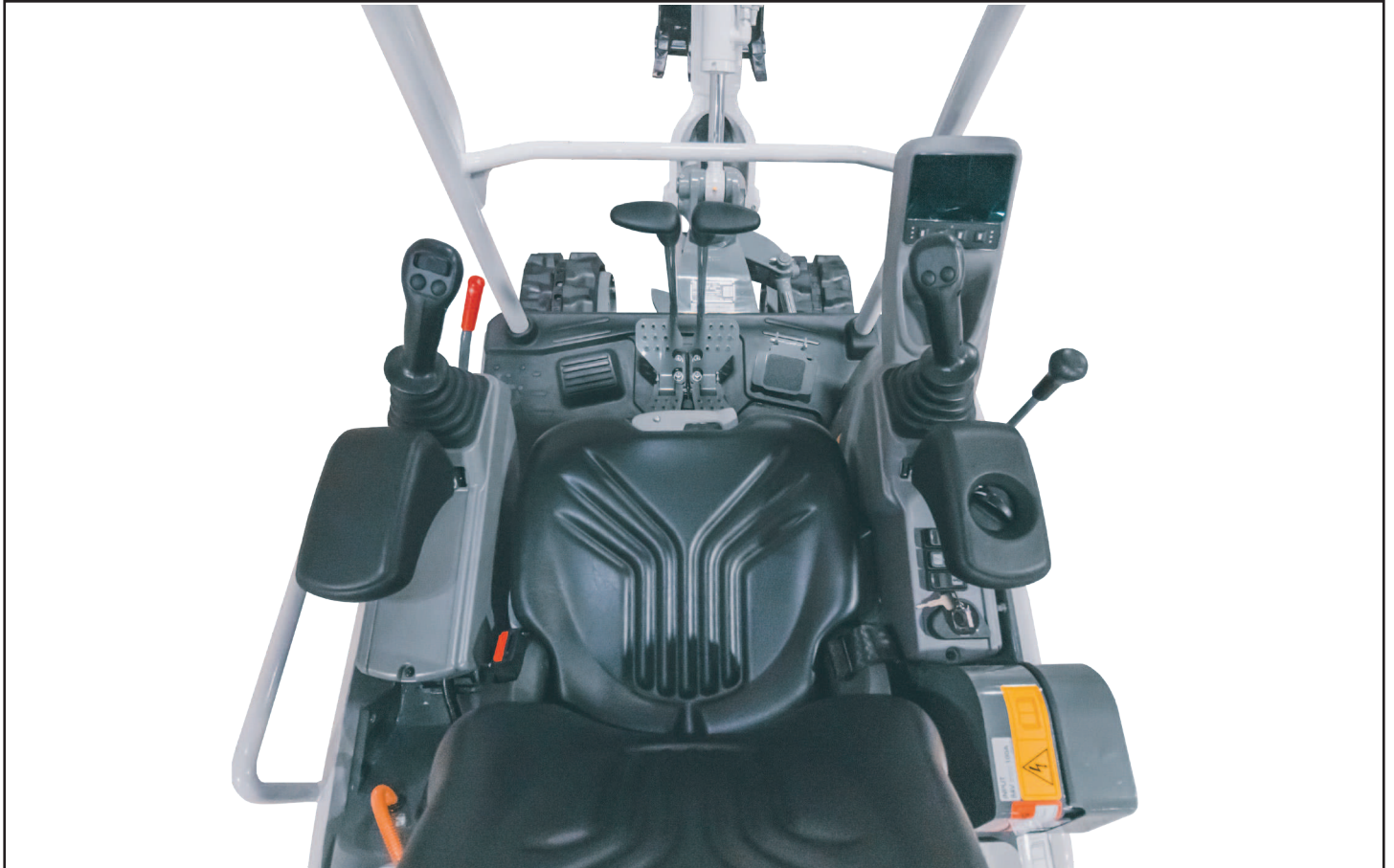
Spacious and Uncluttered Automotive Styled Interior

For customers wanting to reduce their carbon footprint while still being able to get jobs done on time and with minimal downtime, the Takeuchi TB20e provides an abundance of productivity and a reduction of overall operating costs that are associated with traditional diesel-powered construction equipment.