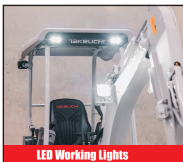
LED Working Lights

**Values in this document are for Europe.