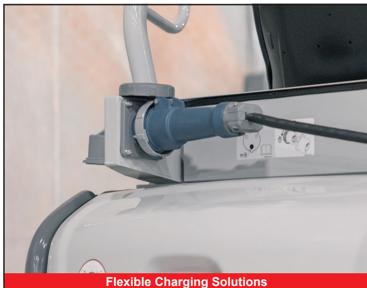
Flexible Charging Solutions

* Reductions of CO2 emissions and service/operation costs are compared with a conventional product of the same class in Japan.