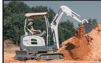
Load Sensing System