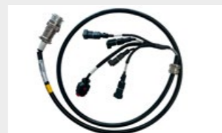
Wiring adaptors Wiring adaptors interface to allows a Plug & Play coupling with the most popular skid steers