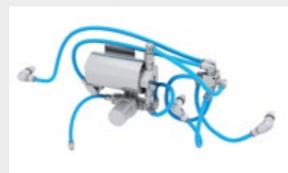
WSS Basic water injection system to reduce dust and cool the teeth